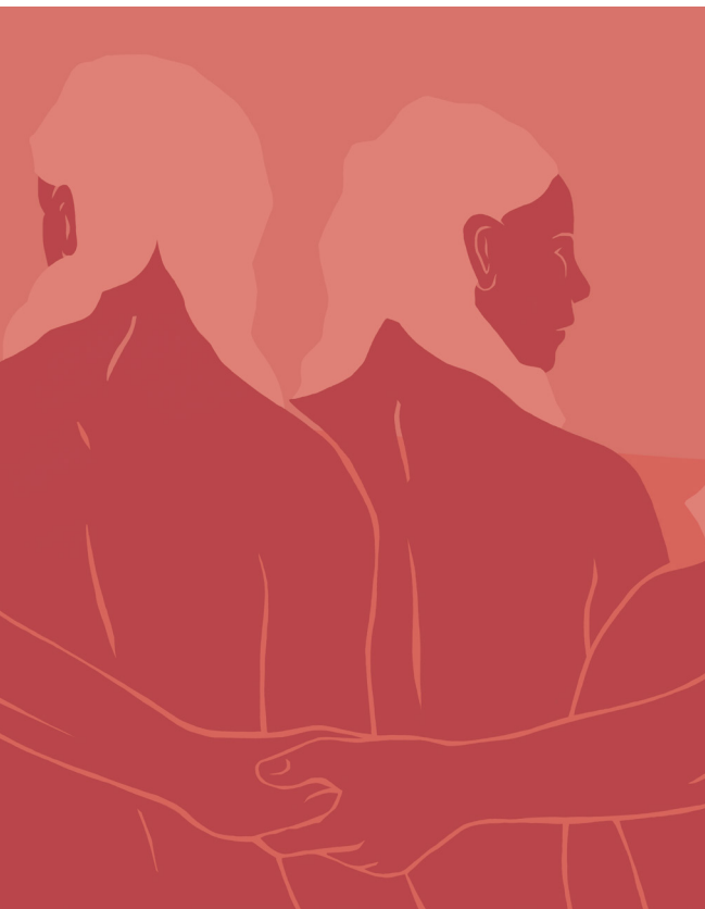
Elléna Lourens, artwork for gin label, for Mount Nelson, 2024

HOW: Click here to shop Mount Nelson's exclusive pet retail range created in collaboration with Chommies.