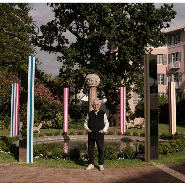
Photo-Souvenir: Daniel Buren, Colourful Halt for Mount Nelson, work in situ, 2023. Detail.

HOW: Click here to download the MITICO 2024 press release.